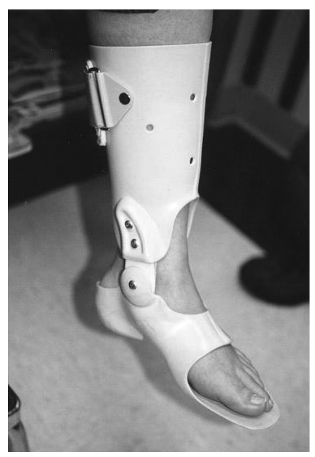
Fig. 1: Short articulated posterior opening ankle-foot-orthosis with instep wrap and full length toeplate.

Two different foot orthoses were used, depending on the duration and severity of the symptoms. A short articulated ankle-foot orthosis (SAAFO) (Figure 1) was used if posterior tibial tendon pain had been present for more than 3 months or the patient was unable to perform a SSHR or ambulate more than one block (33 patients). An FO (Figure 2) was used if posterior tibial tendon pain had been present for less than 3 months, and the patient was able to perform at least