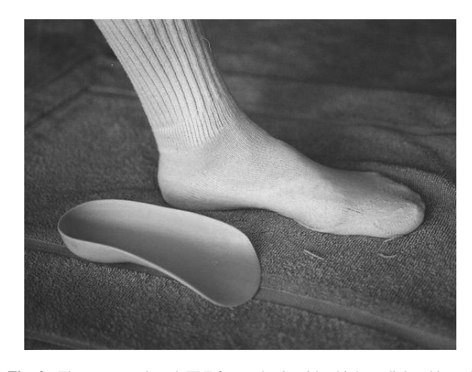
Fig. 2: Three-quarter length TPE foot orthosis with a high medial and lateral trim lines.

one SSHR and could walk more than one block (14 patients). Patients were switched from a SAAFO to an FO when their strengths were within 10% to 15% of the contralateral side and pain had subsided.